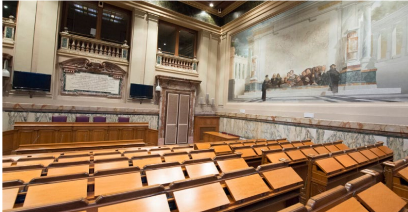
Image 5: Marco Biagi Plenary Hall – otherwise known as the “Parlamentino”