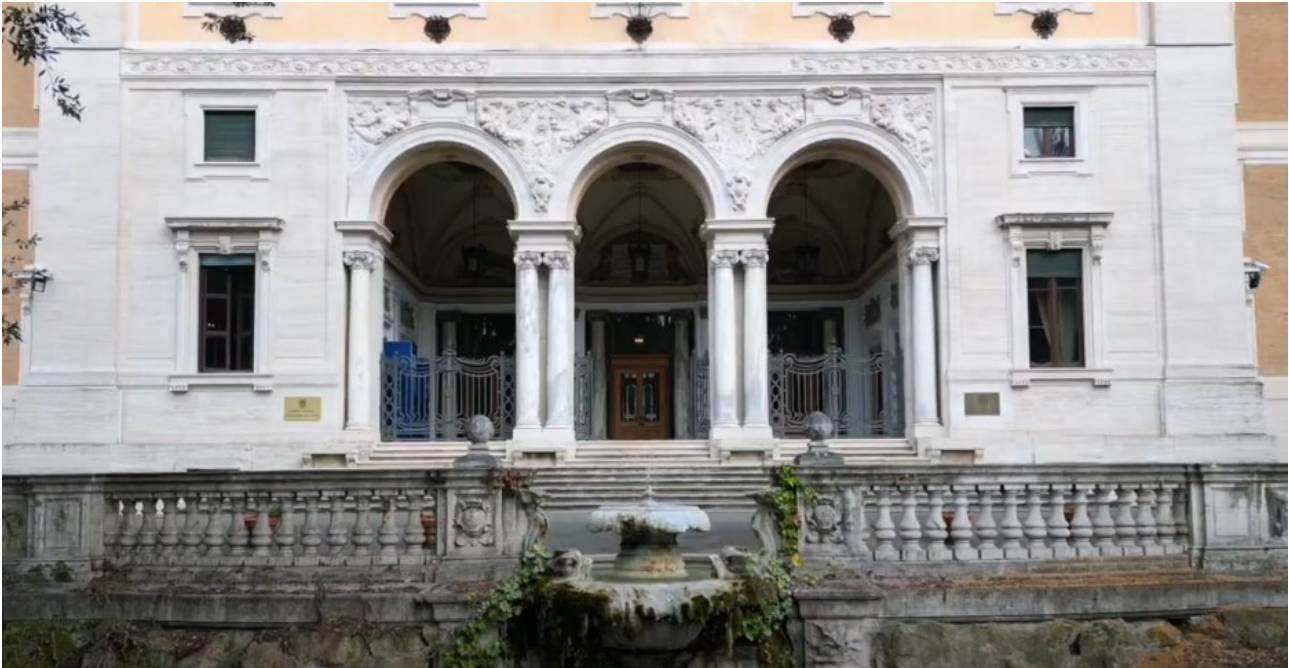
Image 1: Villa Lubin main façade, located inside Villa Borghese. The façade is characterized by a three-arched portico supported by twin columns of colored Serravezza stone