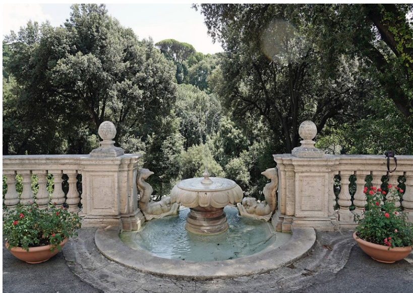
Image 4: Outside the villa, several fountains stand out, especially the one depicting two dolphins and the god of water.