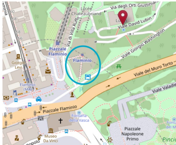
Image 3: Map of Rome, showing the distance from Flaminio Station to Villa Lubin