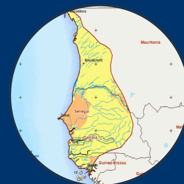
Senegal-Mauritanian Aquifer System