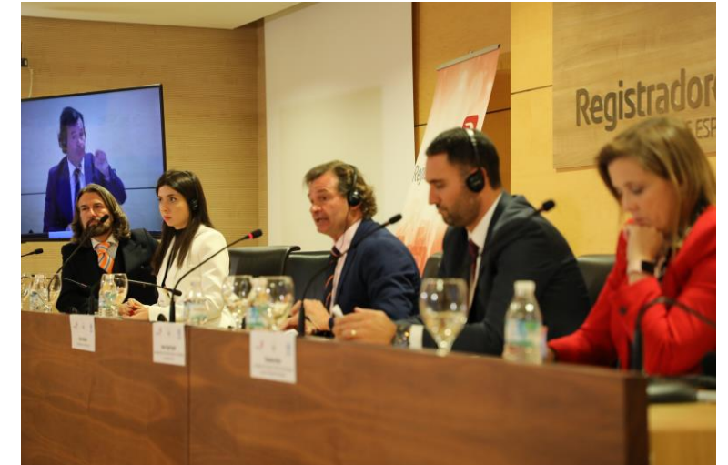
The impact of natural disasters on Tenure Security