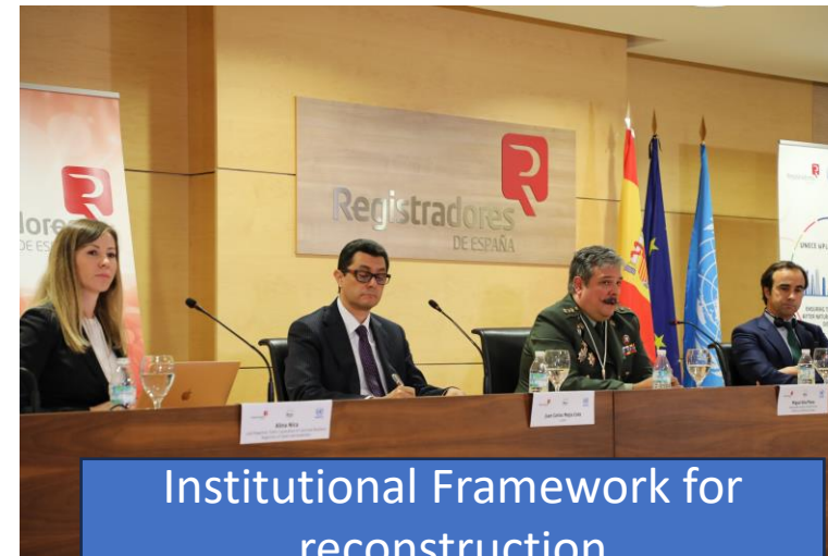
Institutional Framework for reconstruction