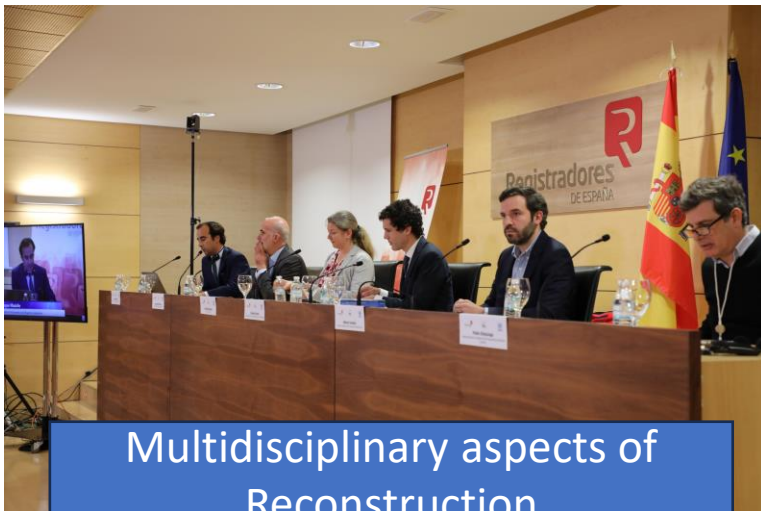
Multidisciplinary aspects of Reconstruction