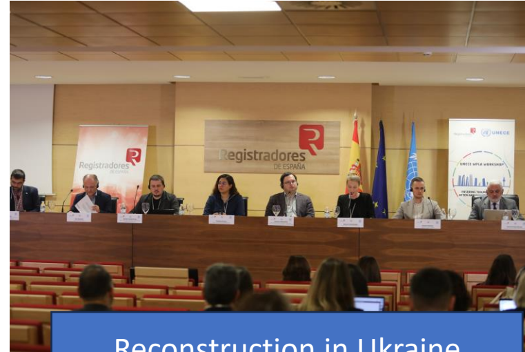
Reconstruction in Ukraine