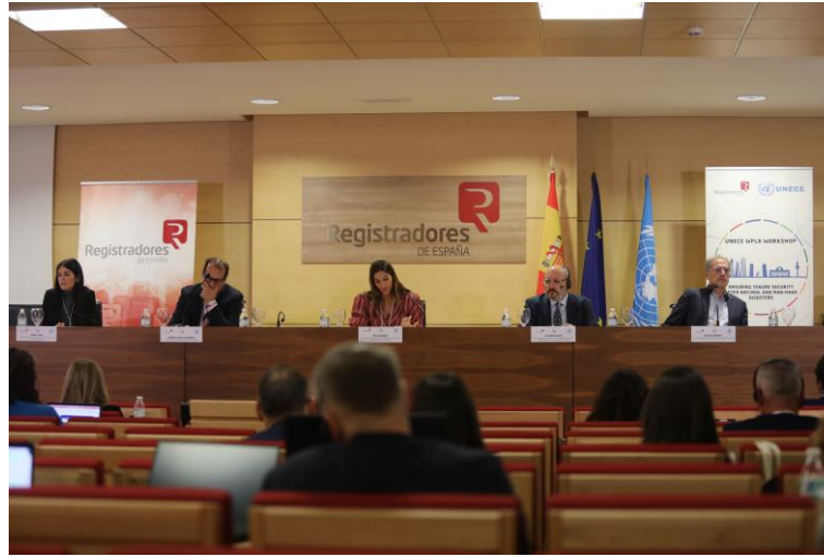
Geospatial information and Tenure Security