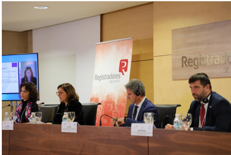
Legal aspects of Tenure Security