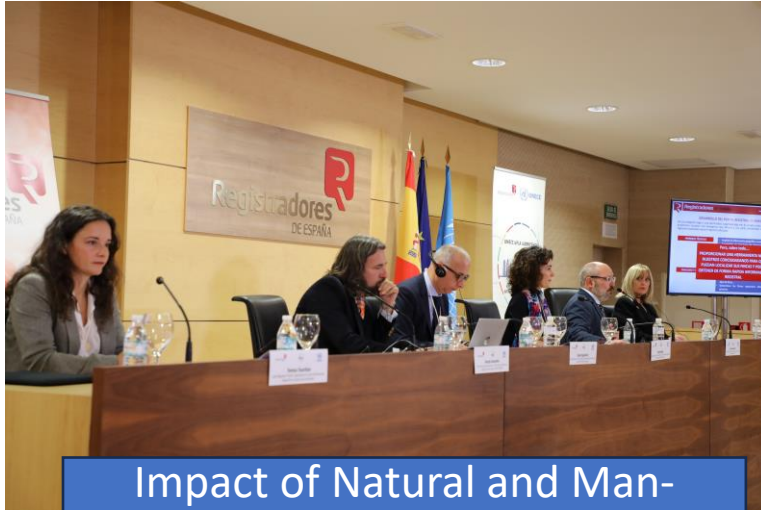
Impact of Natural and Man-made disasters