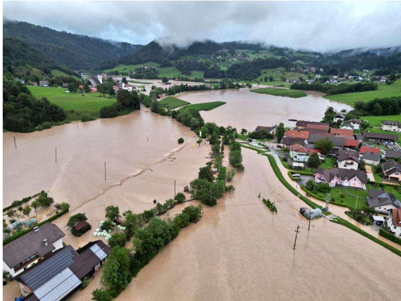
Polhov Gradec, Slovenia