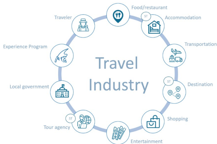
Figure 1: Sustainable tourism standards are reviewed and classified into ten categories

The literature and current existed standards related to sustainable tourism are reviewed and classified into ten categories according to the service content or products provided by the tourism sectors, including travel agency, accommodations, transportations, restaurant, destination, shopping, entertainment, local government, experience program, and traveler. In achieving the SDGs by 2030, this white paper discussed the sustainable planning and actions could be adopted across ten tourism sectors. It's expected that more discussion on business standards of sustainable tourism can serve as a reference to foster feasibility of building a future electronic exchange system database in beneficial for sustainable development in the tourism industry.