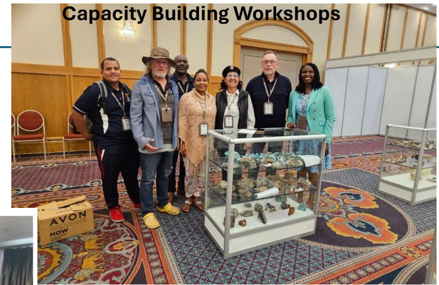
Capacity Building Workshops