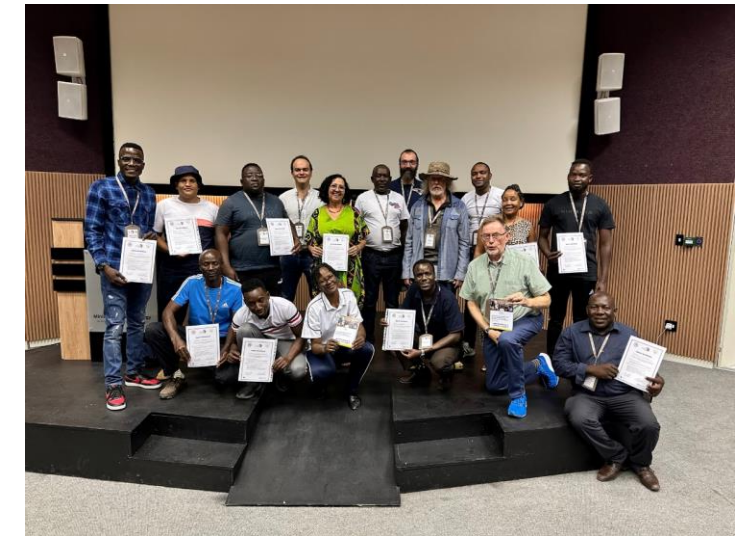
ASM showing off their certificates at the end of a training workshop on Health and Safety Issues in Artisanal and Small-Scale Mining