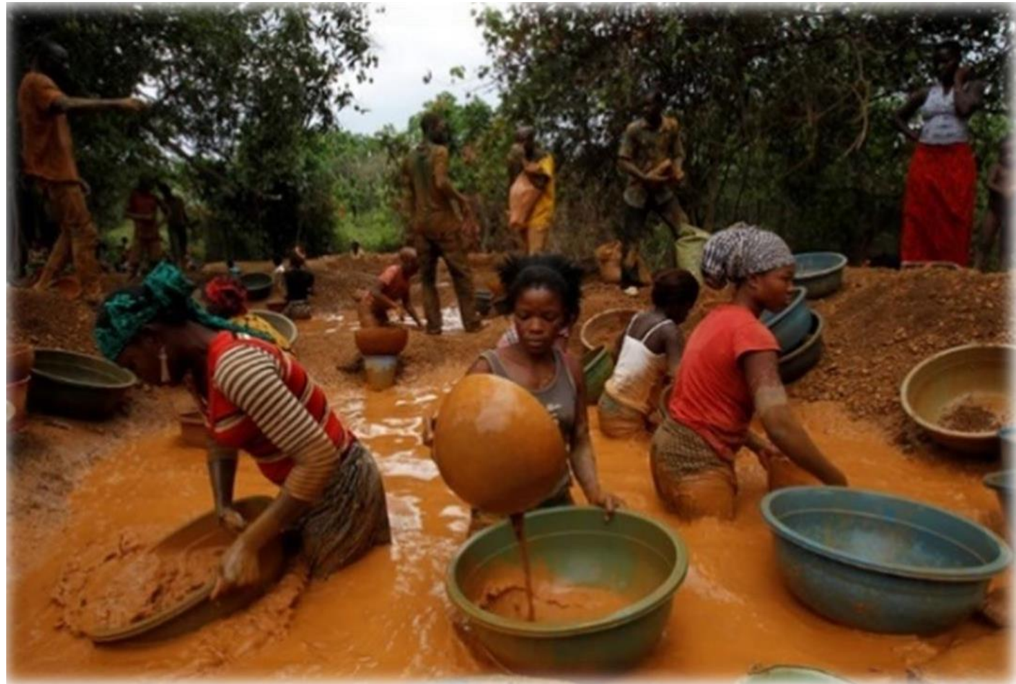
Women Panning, Zimbabwe