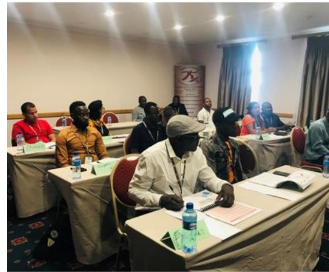
Basics of Business skills training workshop