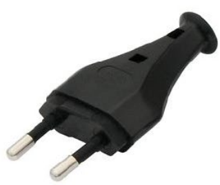
Type C: This will fit