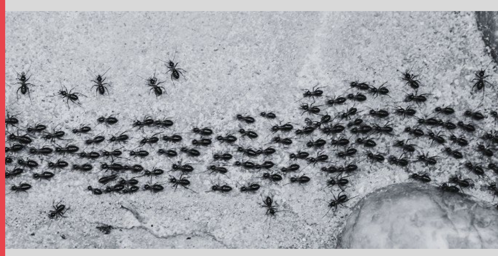
PLANT AND ANIMAL BEHAVIOUR INDICATORS

Sunbird or Wild Mango-Mtondo (Cordyla africana) tree with Black ants-Midzodzo moves together in a long queue of colony