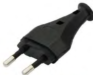
Type C: This will fit