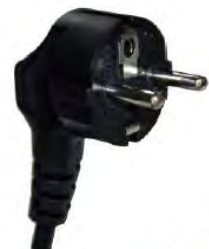
Type F: This will NOT fit