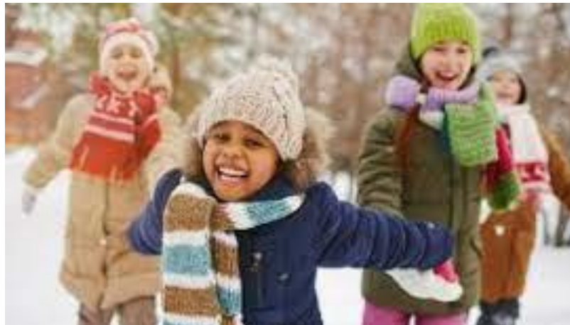
Living Conditions Survey among Children