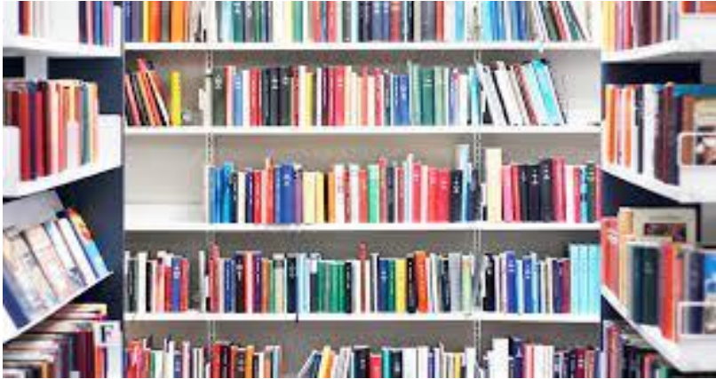
Cultural Activity Survey