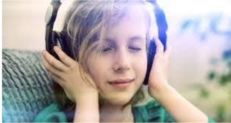
Media Use Survey