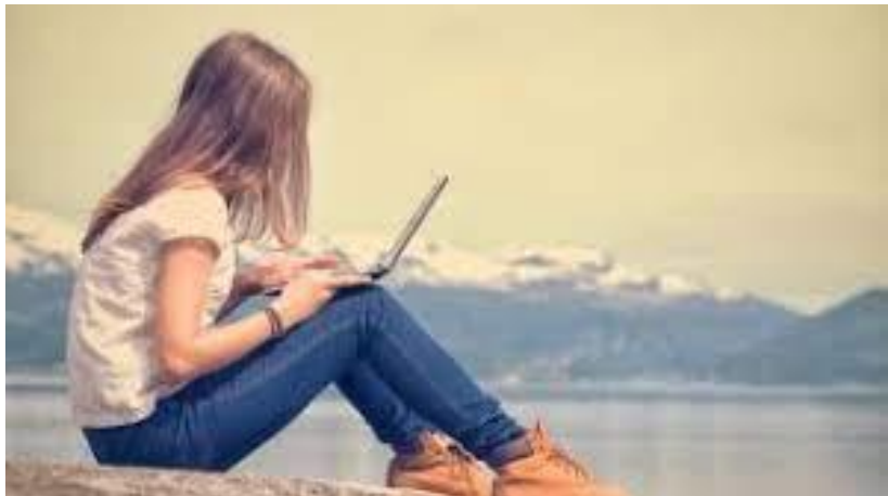
Time Use Survey