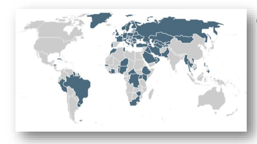
Convention on Road Traffic 1968

Convention on Road Signs and Signals 1968