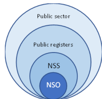
Figure 2 Possible coverage of NSO's data stewardship role

When shaping their role in data stewardship, NSOs must take into account their institutional position within the public administration. We can distinguish three main governance models, the two extremes being a fully centralized and a fully distributed model. The most widely used in practice and best suited for an all-of-government approach is the federated hybrid model. It has a centralized structure that oversees the