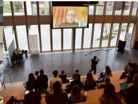
The city of the future is a green city – RFSD – 30 March 2023