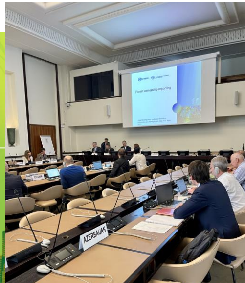
Joint Working Party - 2 June 2023