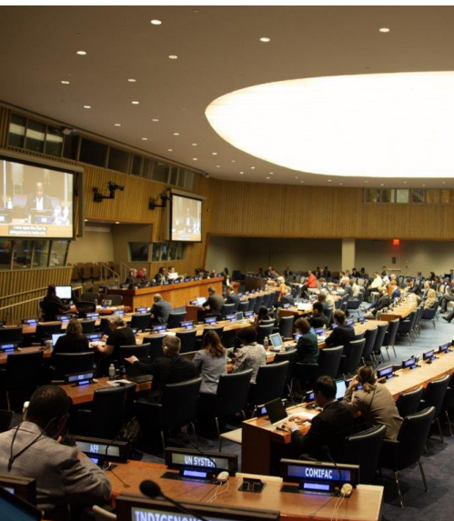
18th session of the UN Forum on Forests – 8-12 May 2023