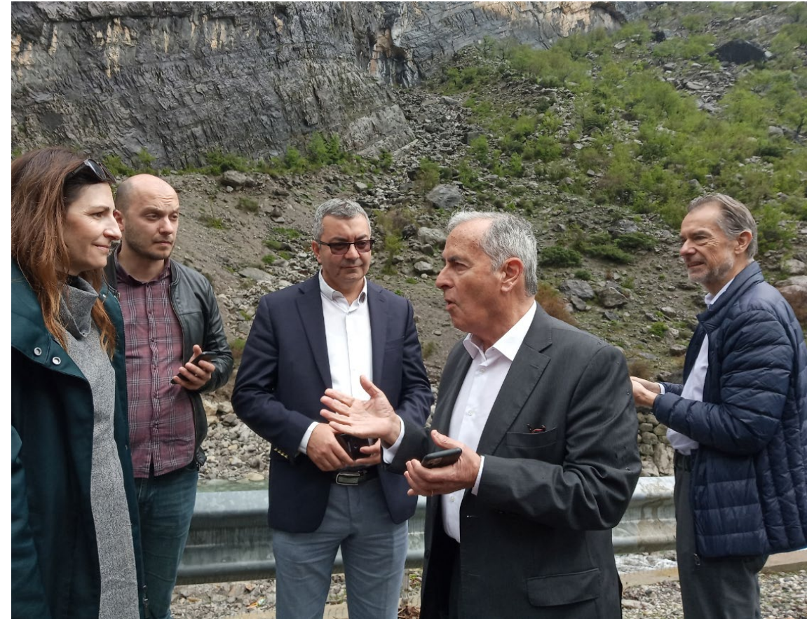
Committee members visit Murras and Dobrinje small hydropower plants together with delegations from Albania and Montenegro