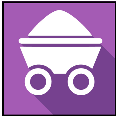
Group of Experts on Coal Mine Methane and Just Transition