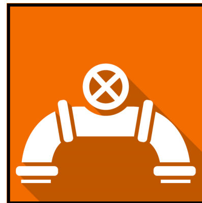
Group of Experts on Gas