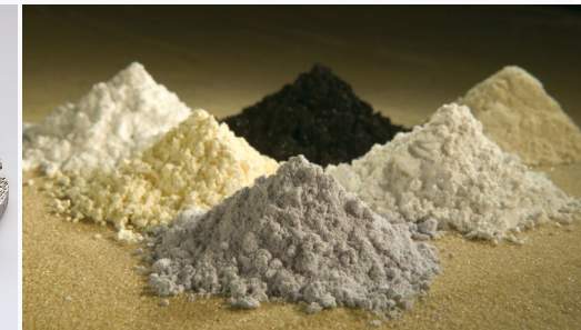
Peggy Greb ( https://en.wikipedia.org/wiki/Rare-earth_element#/media/File:Rareearthoxides.jpg )