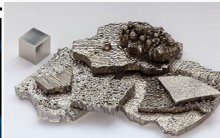
Alchemist-hp ( https://commons.wikimedia.org/wiki/User:Alchemist-hp )