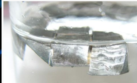
Tomihahndorf ( https://en.wikipedia.org/wiki/Lithium#/media/File:Lithium_paraffin.jpg )