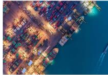
UN Global Survey on Digital and Sustainable Trade Facilitation