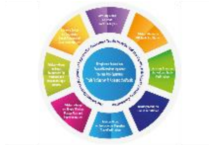
United Nations Network of Experts for Paperless Trade and Transport in Asia and the Pacific (UNNExT)