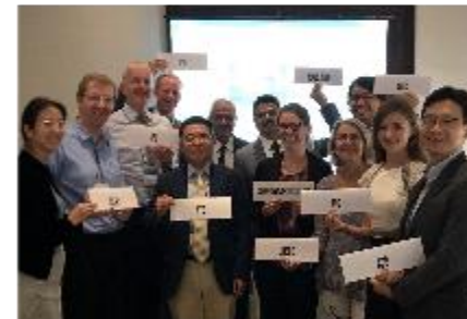
Regional Organizations Cooperation Mechanism for Trade Facilitation (ROC-TF)