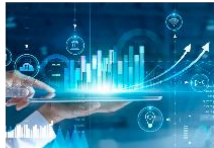
Cross-Border Paperless Trade Readiness Assessment