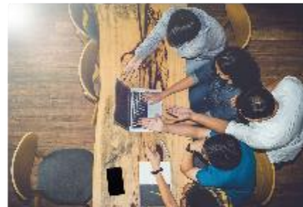
E-Learning Series on Business Process Analysis for Trade Facilitation