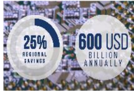
Framework Agreement on Cross-Border Paperless Trade