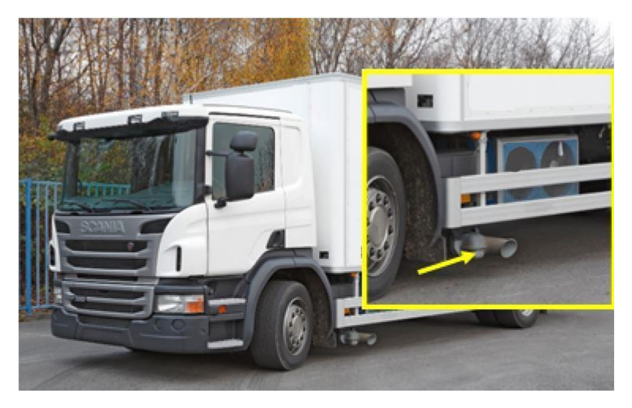
10. Case No. 6: Semi-trailers with deflectors: