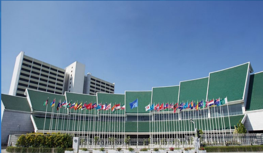
41th UN/CEFACT Forum 02 - 06 October 2023 Bangkok, Thailand