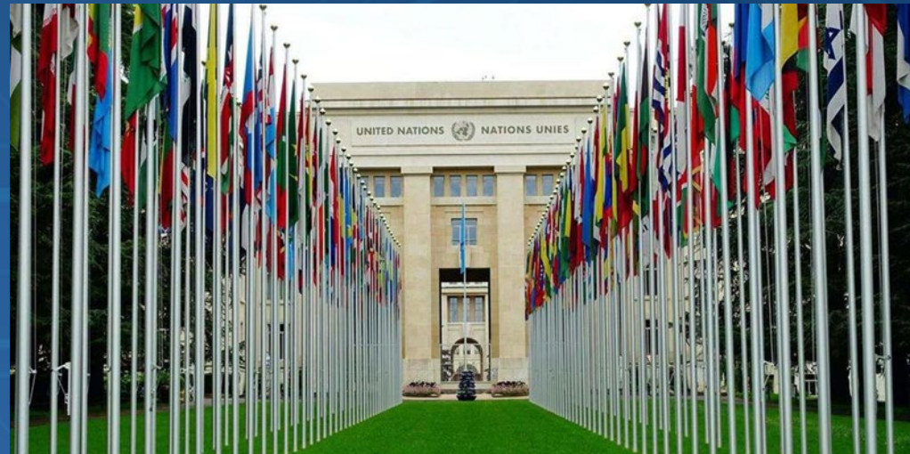
29th Session - UN/CEFACT Plenary 9 - 10 November 2023 Palais des Nations, Geneva, Switzerland