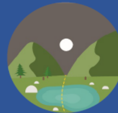
Transboundary Diagnostic Analysis