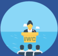
International Waters Conference