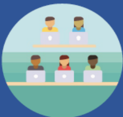
Regional Training Workshops