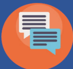
Global Dialogue Participation