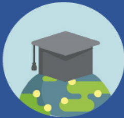
Online thematic courses