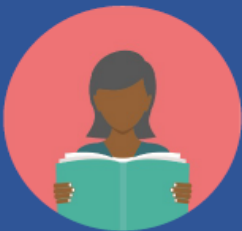
Manuals and E-books