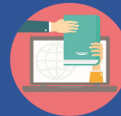
Learning Exchange Service Center