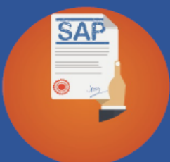
Strategic Action Programme