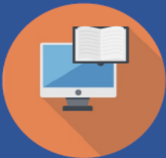
Portfolio Results Archive