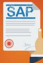
Strategic Action Programmes