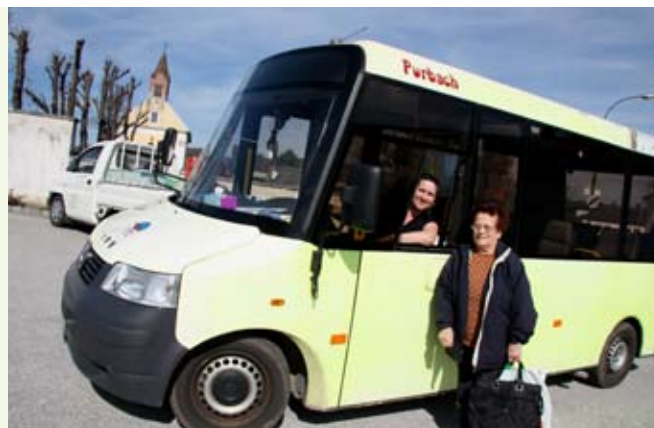
On-demand buses in rural areas make public transport services more accessible in Austria

www.klimaaktivmobil.at ; www.lebensministerium.at ; robert.thaler@lebensministerium.at ; THE PEP Project and local mini buses: www.sensiblegebiete.at ; www.b-mobil.info ; www.purbach.at ; www.breitenbrunn.at ; www.mörbisch.at ; Mobility centers: www.perg.mobitipp.at ; www.mobilzentral.at ; Integrated regional public transport systems: www.vmobil.at ; www.vvt.at