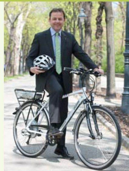
Electric bicycle boom in Austria: good for the environment and the economy

Further information: www.klimaaktivmobil.at ; www.green-jobs.at ; www.lebensministerium.at ; robert.thaler@lebensministerium.at