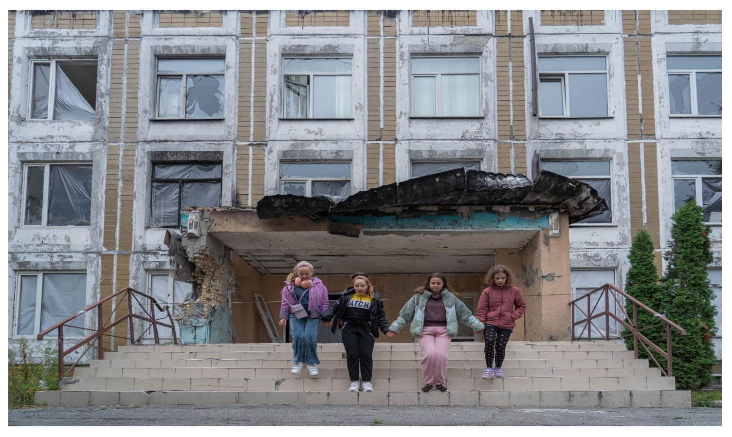
Partnership Network "Education for Sustainable Development in Ukraine"