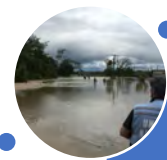
Hurricanes Eta & Iota (Nov-Dec 2020)