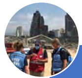
Beirut Explosions (Aug 2020)