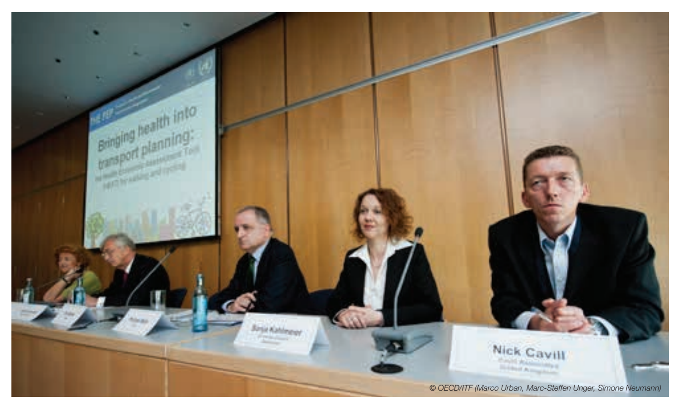
Launching a new version of THE PEP WHO Health Economic Assessment Tools (HEAT) for walking and cycling at the International Transport Forum in Leipzig (May 2011)