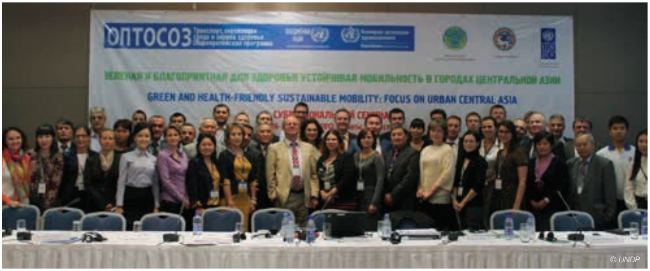
Large international participation in THE PEP workshop on green and health-friendly sustainable mobility: focus on urban central Asia in Almaty, Kazakhstan (September 2013)