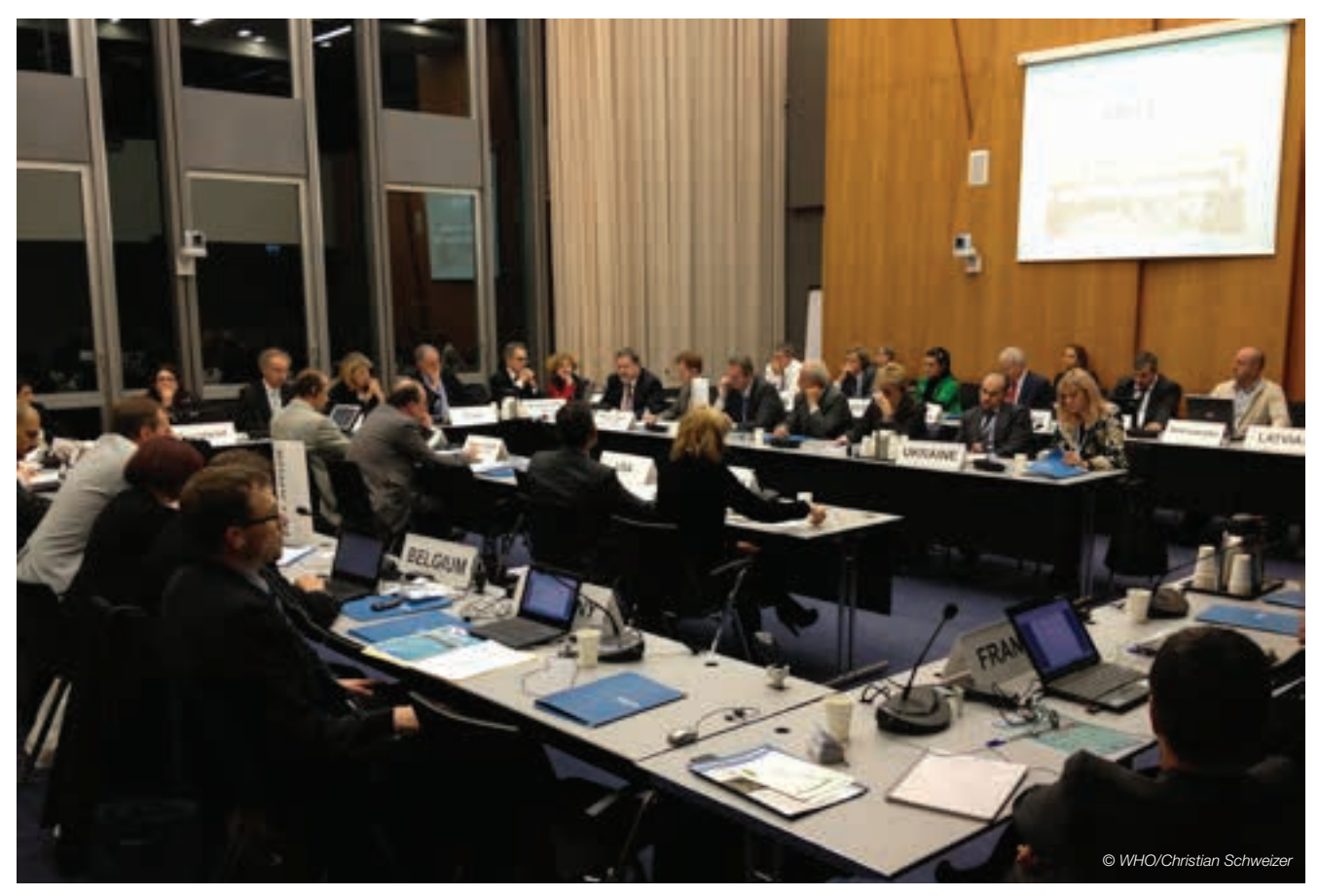
Delegates from across the pan-European Region at the 10th Session of the Steering Committee of THE PEP in Geneva (November 2012)