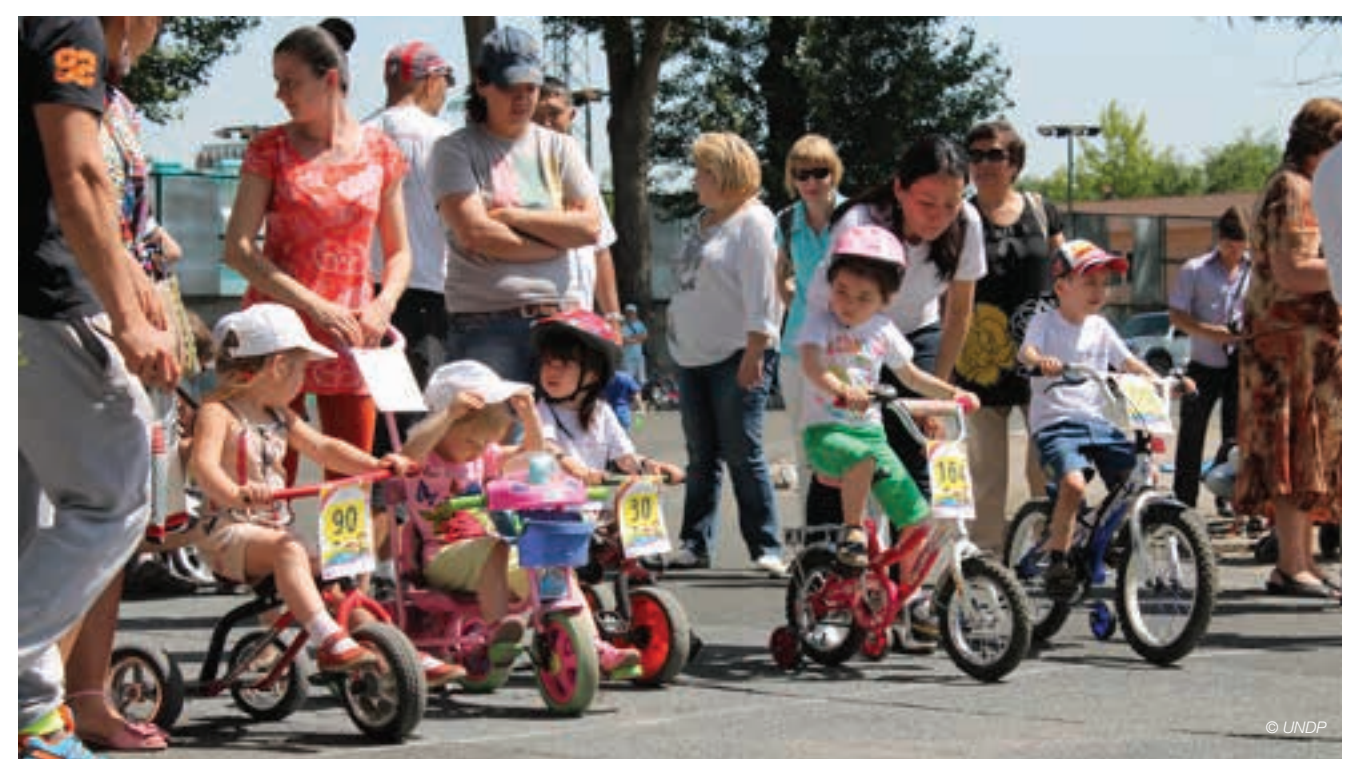
Encouraging the next generation of cyclists in Almaty, Kazakhstan (September 2013)

Boxes 16–20 show examples of progress made and lessons learnt by Member States that hosted THE PEP Staffete workshops.