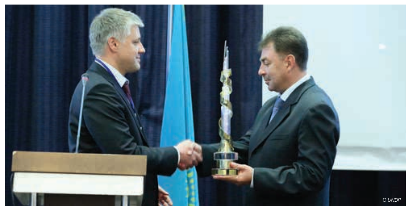
Handing over the Baton of THE PEP relay race from Moscow to Almaty at THE PEP workshop in Almaty, Kazakhstan (September 2013)