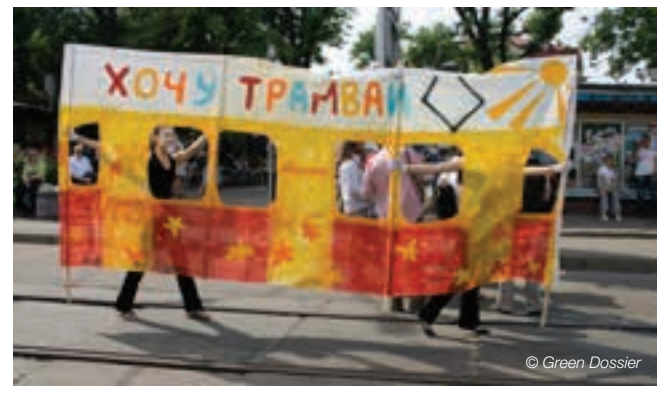
Street art performance at THE PEP workshop on working together for sustainable and healthy urban transport in Kyiv (June 2011)

Cycling communities and infrastructures are developing, starting in Lviv and Kyiv. The projects are assisted by Deutsche Gesellschaft für Internationale Zusammenarbeit (GIZ) and by the cities' administrations. Events such as European Mobility Week and a competition to identify the best bike-friendly employer are gaining in popularity. The cycling community of Kyiv participates in these events and advocates for the development of cycling infrastructure in Kyiv.