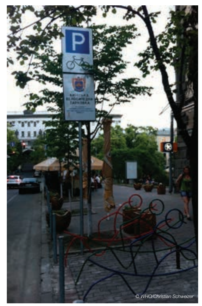
Bicycle parking in Kyiv (June 2011)

Austria, France and Switzerland generously supported the production of this publication.