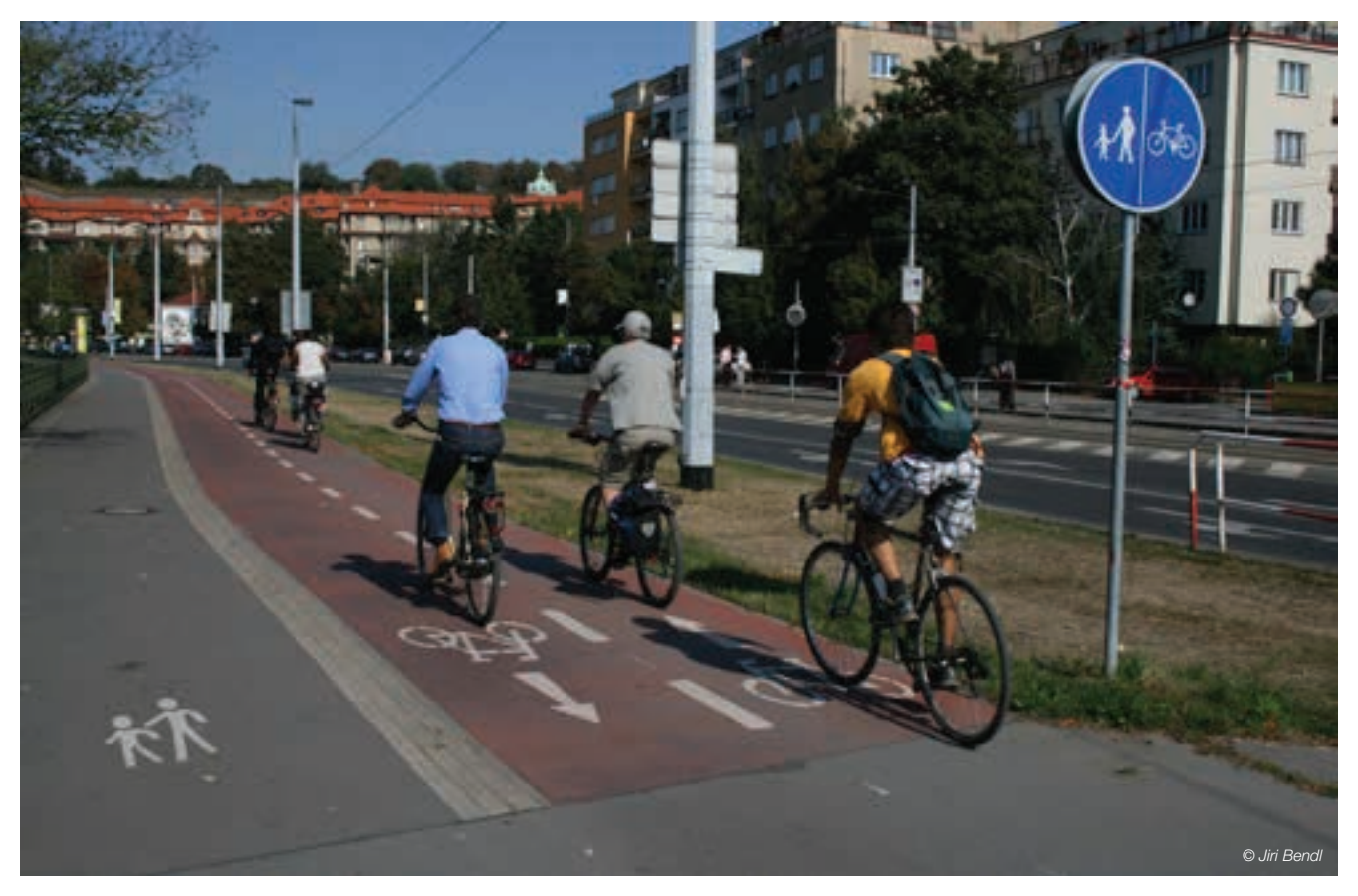
Bicyle ride excursion during THE PEP workshop on safe and healthy walking and cycling in urban areas in Pruhonice, Czech Republic (September 2009)