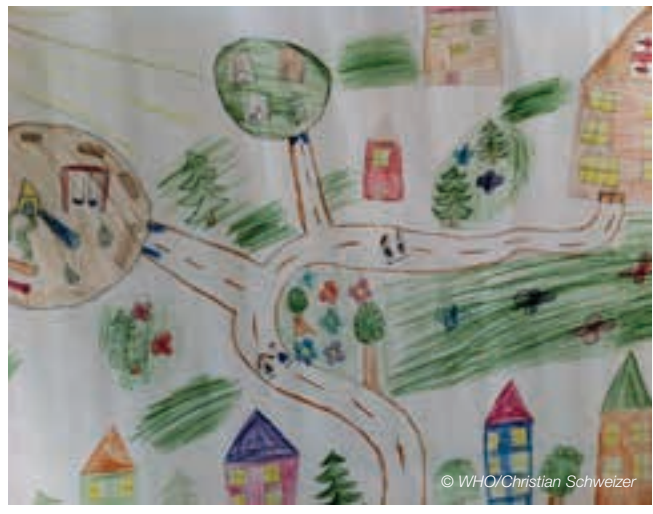
Children's drawing of their idea of a healthy environment in Batumi, Georgia (October 2010)

The workshop raised awareness and led to: the construction of cycling lanes in many cities (Batumi, Kutaisi, Rustavi, Kvareli); development of road infrastructure that improves safe walking and cycling; revised legislation to include new road safety measures; and the renovation of public transport.