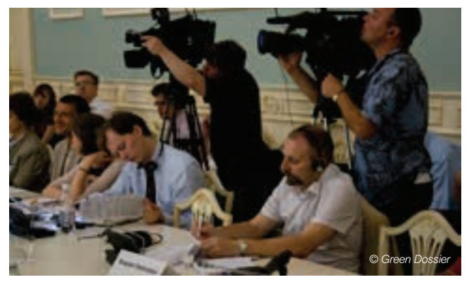
High media attention at THE PEP workshop on working together for sustainable and healthy urban transport in Kyiv (June 2011)