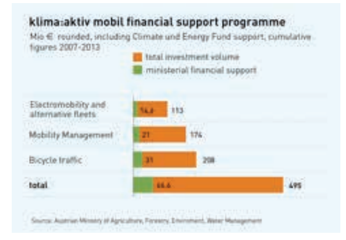
Fig. 2. klima:aktiv mobil financial support programme