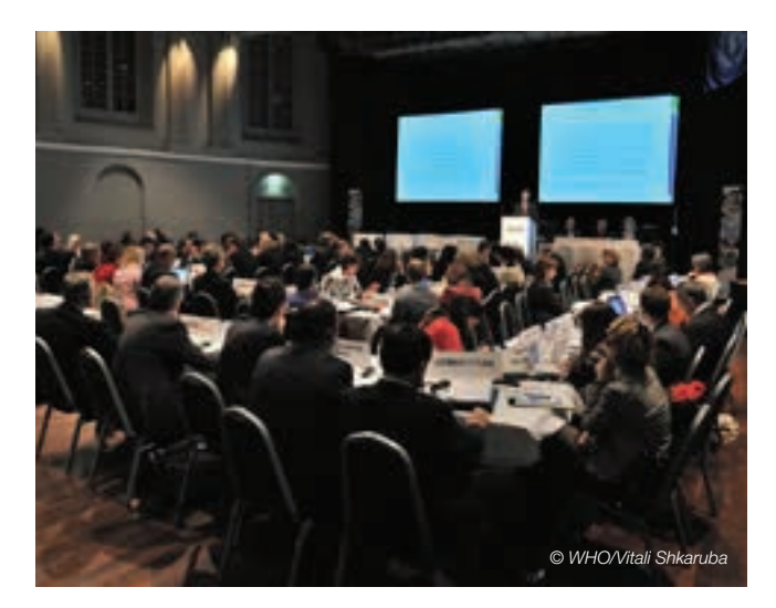
Plenary session at the Third High-level Meeting on Transport, Health and Environment in Amsterdam (January 2009)

France Vélo Tourism (France Cycling Tourism) is a group of local authorities, professionals and companies, supported by the State, that aim to strengthen the economic development of cycle tourism in France. France Vélo Tourism launched a programme of complementary actions, i.e. development of a website that helps the public plan and organize cycling holidays; contribution to the launch of a complete collection of guides for bicycle tourism; promotion of the cycling tourism sector in France through public relations and events; improvement in supplying services, including the development of a national charter Accueil Vélo ; and support for activities on the harmonization of road signs (7).