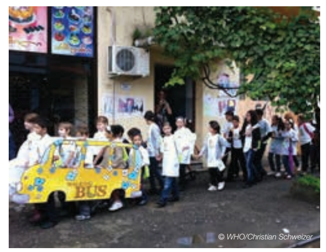
A walking school bus was initiated through THE PEP workshop on safe and healthy walking and cycling in urban areas in Batumi, Georgia (October 2010)