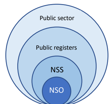
Figure 2. Possible coverage of NSO's data stewardship role

Data stewardship is applicable at all scales, from the national to data system level (system-wide stewardship), to the organization or agency level (intra-agency stewardship), to the individual or dataset. For the possible coverage of the NSO's stewardship role in the national data ecosystem, see figure 2.