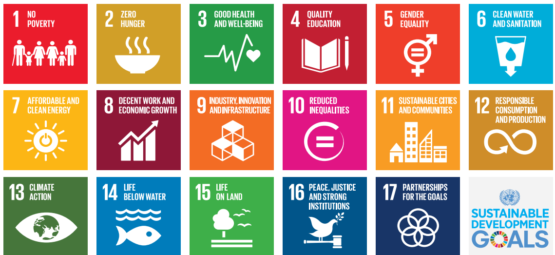
Fig. 2. The United Nations SDGs

The SDGs and their targets provide clear guidelines for all countries, and take into consideration their different capacities, levels of development, and priorities while tackling environmental challenges at the global level.