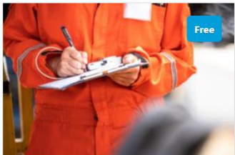
Introduction to Conformity Assessment