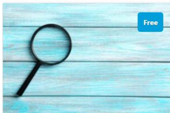
Introduction to Market Surveillance