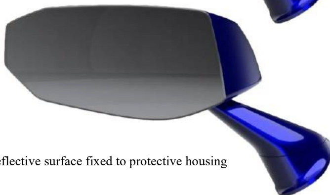
Figure 3: Reflective surface fixed to protective housing