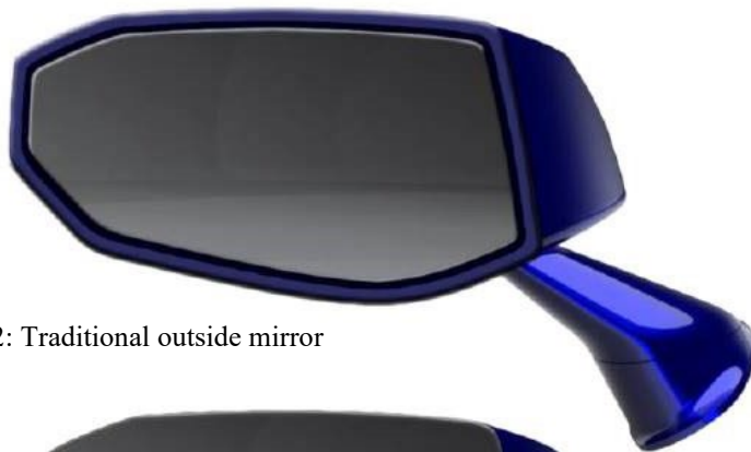
Figure 2: Traditional outside mirror