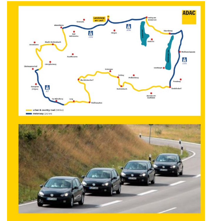
IN-VEHICLE REAL LIFE