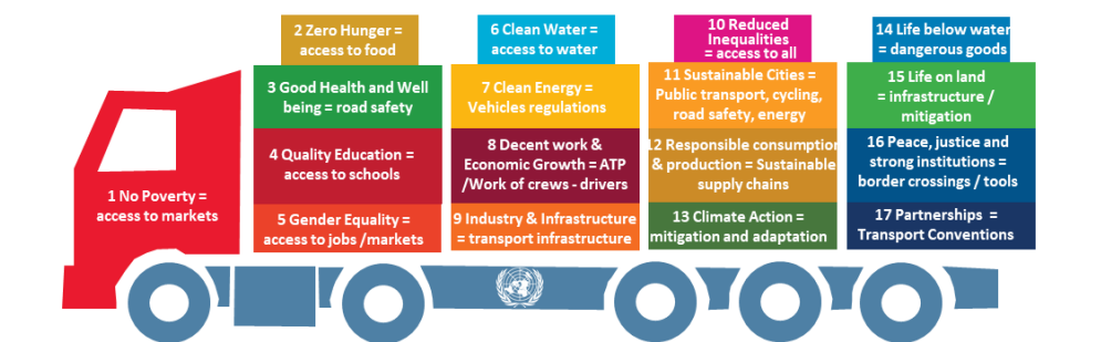
Figure II The Sustainable Development Goals and their interlinkages with the transport sector.

12. Sustainable transport is a cross-cutting accelerator that can fast-track progress towards other crucial goals such as eliminating poverty in all its dimensions, lowering inequality, and combatting climate change. As a result, sustainable transport is crucial in achieving the 2030 Agenda for Sustainable Development as well as the Paris Agreement on Climate Change. These goals can only be realised if interlinkages between Sustainable Development Goals (SDGs) and sustainable transport, as demonstrated in Figure 2, are well understood along with recognising the targets of these goals [25, 26, 27].