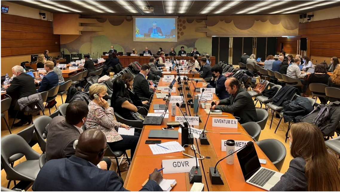
3(a): Coordination mechanisms and synergies