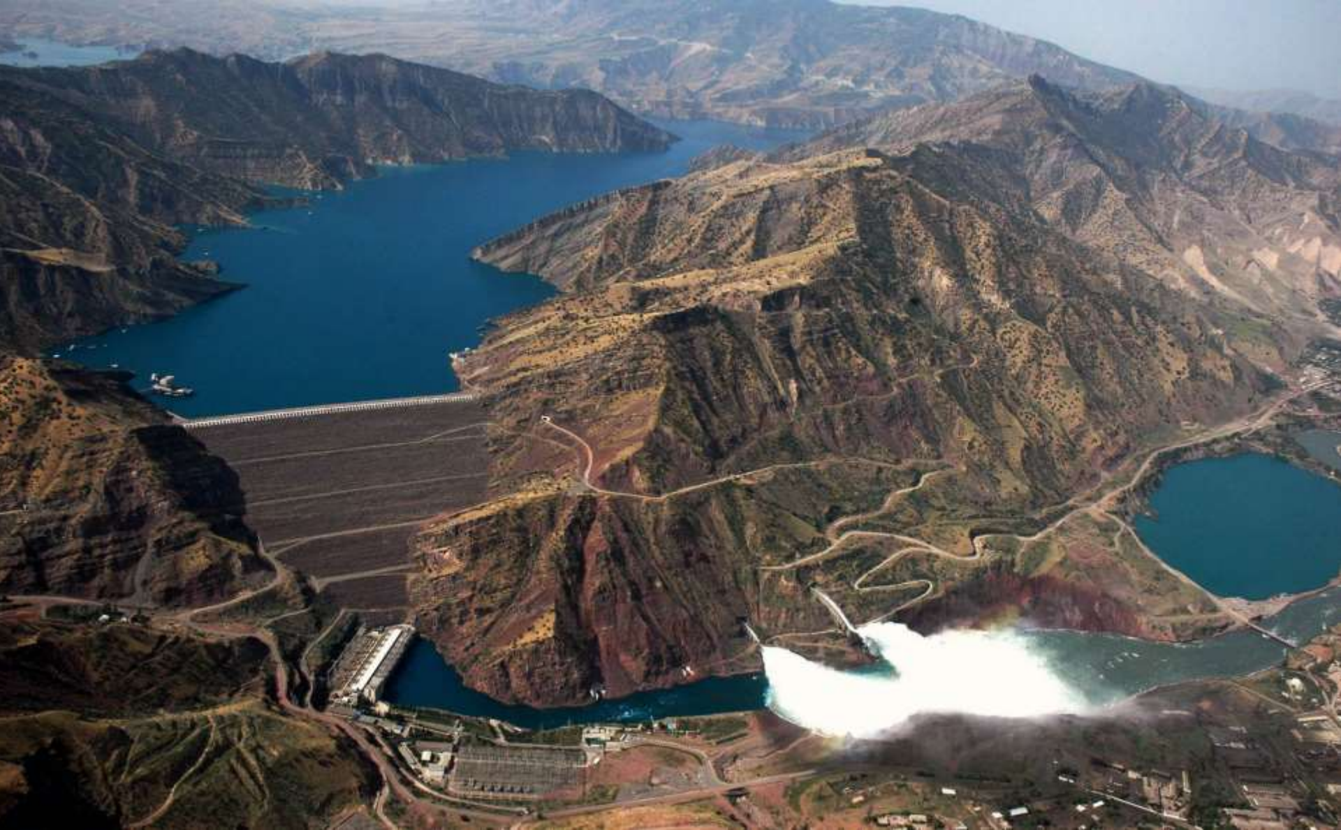
Nurek hydroelectric power plant