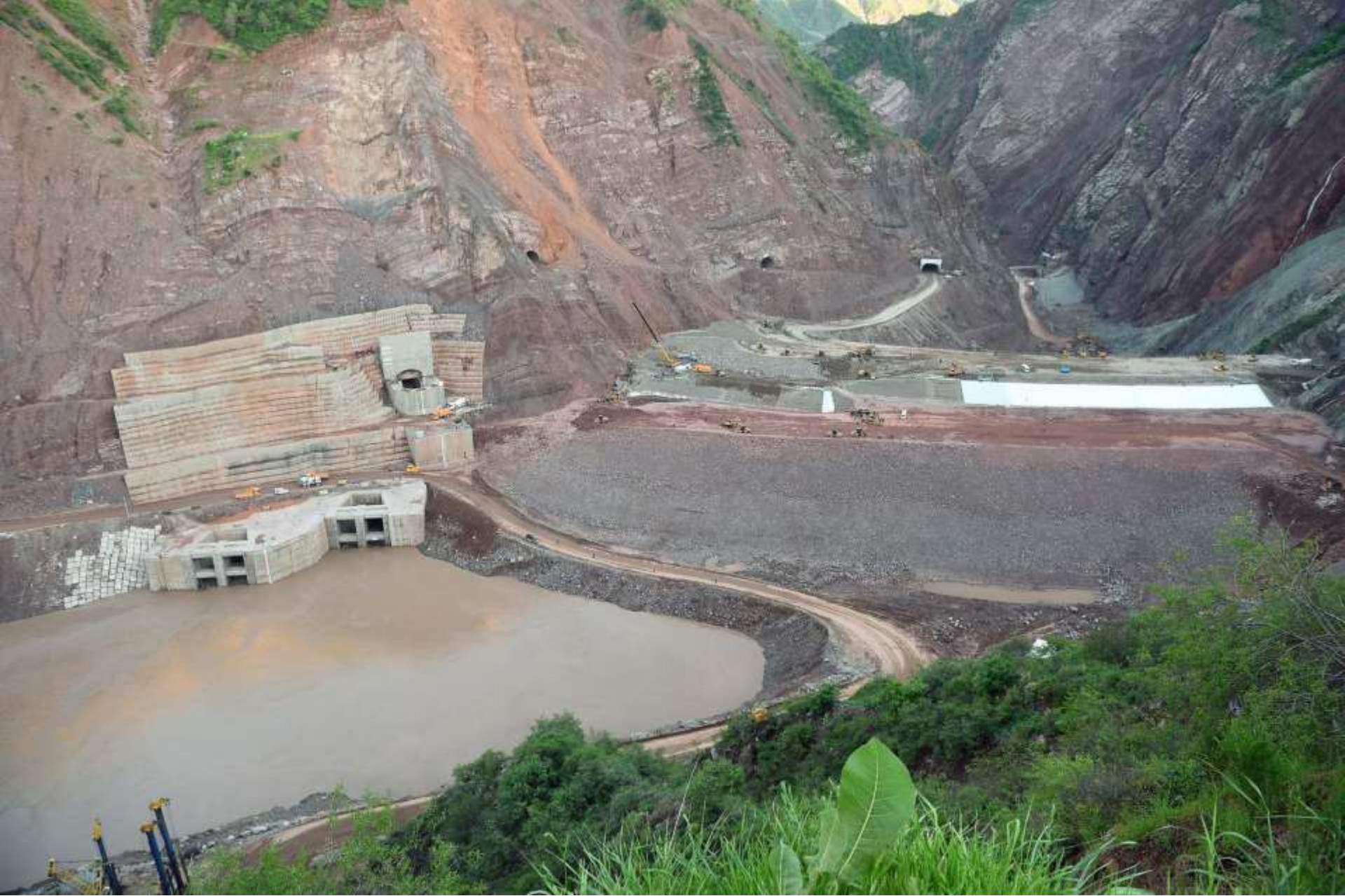
Roghun hydroelectric power plant