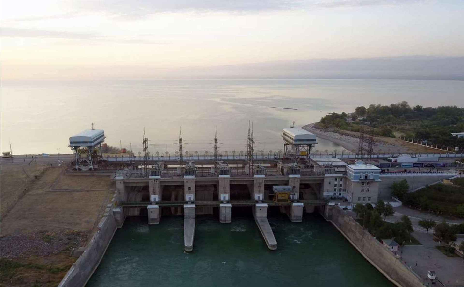
Kayrakkum hydroelectric power plant