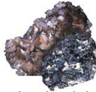
Lead and zinc