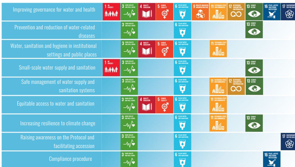
Figure 1 Synergies between the Sustainable Development Goals and the Protocol’s programme of work for 2023–2025

Source: Based on Protocol on Water and Health and the 2030 Agenda: A Practical Guide for Joint Implementation , figure 2, p. 6 (United Nations publication, Sales No. E.19.II.E.15).