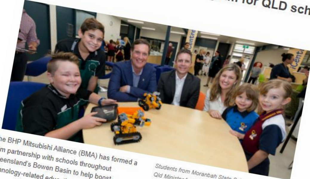
The BHP Mitsubishi Alliance (BMA) has formed a $5m partnership with schools throughout Queensland's Bowen Basin to help boost technology-related education.