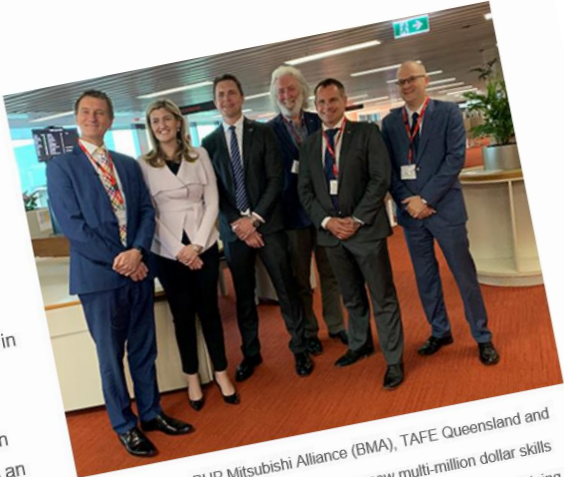
Mining company BHP Mitsubishi Alliance (BMA), TAFE Queensland and CQUniversity Australia today announced a new multi-million dollar skills partnership that will support the introduction of new technology in mining.

Minister for Skills and Training Development Shannon Fentiman commended the partners stating the partnership and project is an excellent example of Queensland's public training providers coming together with industry to support new and emerging skill needs impacting Queensland.