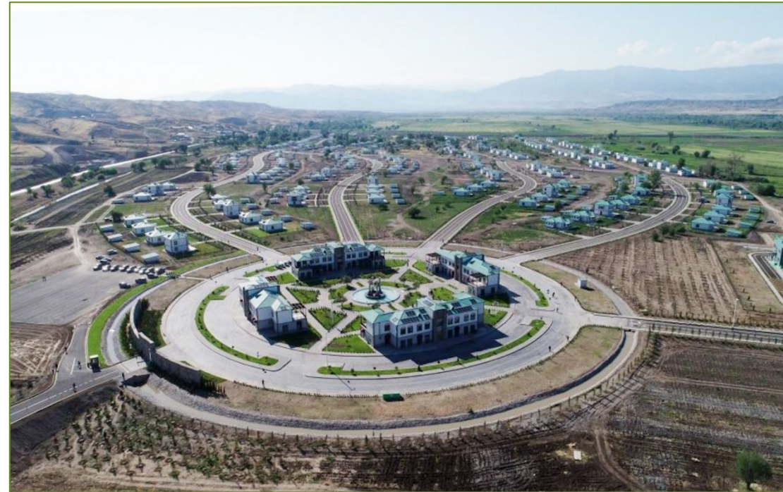
4. Ağalı village, Zangilan, 2022