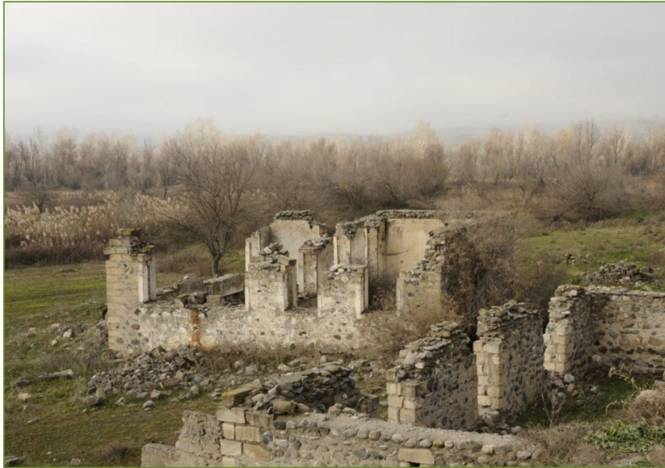
3. Ağalı village, Zangilan, 2020