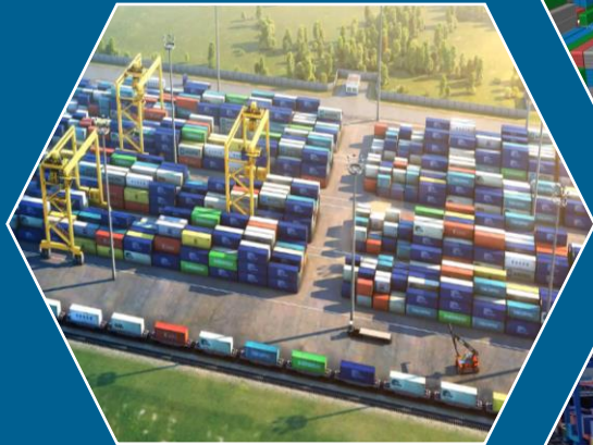
Container terminals of sea ports