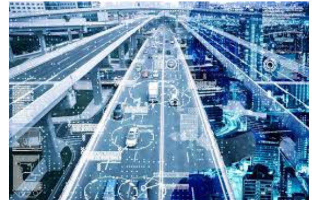
ITS technology has yet to emerge in a significant way – why?