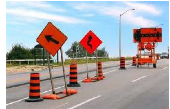
Construction zone signage