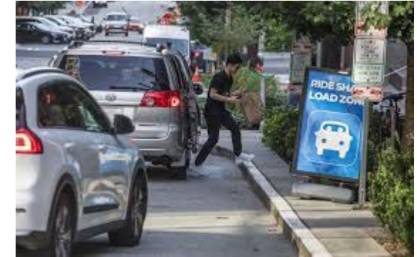
Expand & improve designated Pick-up & Drop-off areas