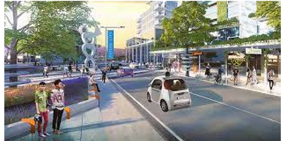
What does the near-future city look like?