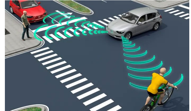
Pedestrian, Cyclist, and Other Safety Detection Systems.