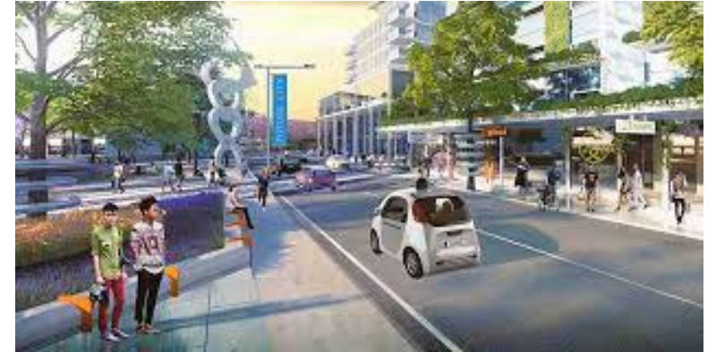
What does the near-future city look like? (Image – Place Design Group)