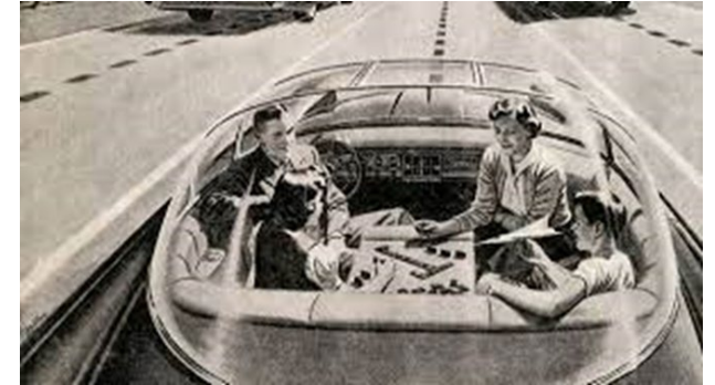
An automated future is coming soon - 1956