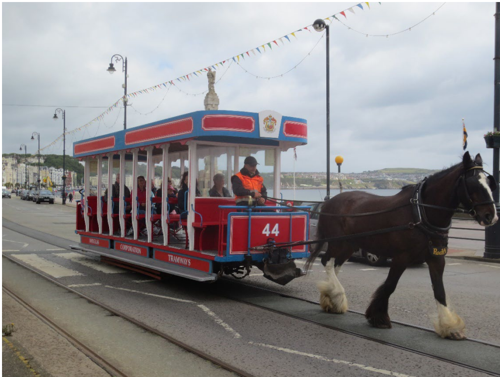
(Note: refers to the tram elements)