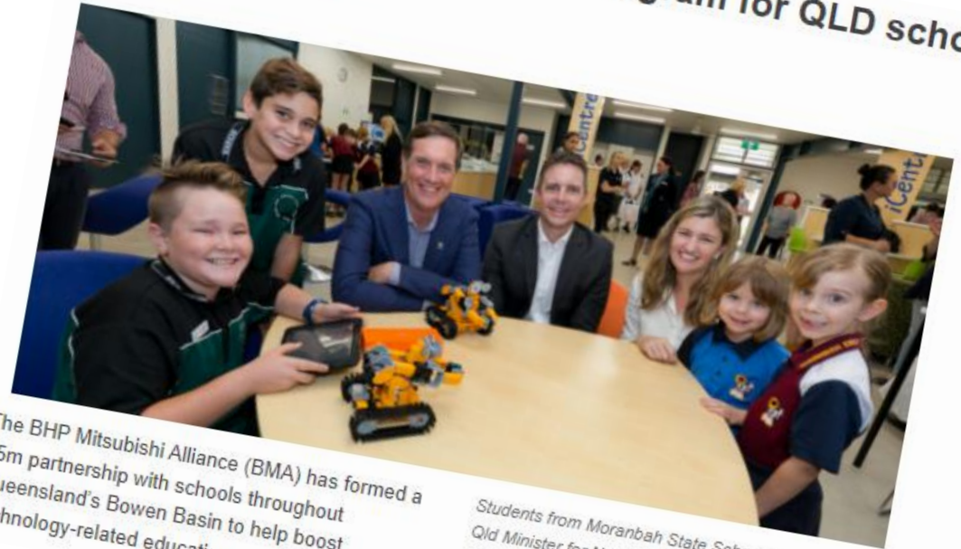
The BHP Mitsubishi Alliance (BMA) has formed a $5m partnership with schools throughout Queensland's Bowen Basin to help boost technology-related education.