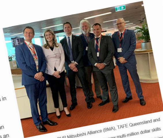
Mining company BHP Mitsubishi Alliance (BMA), TAFE Queensland and CQUniversity Australia today announced a new multi-million dollar skills partnership that will support the introduction of new technology in mining.