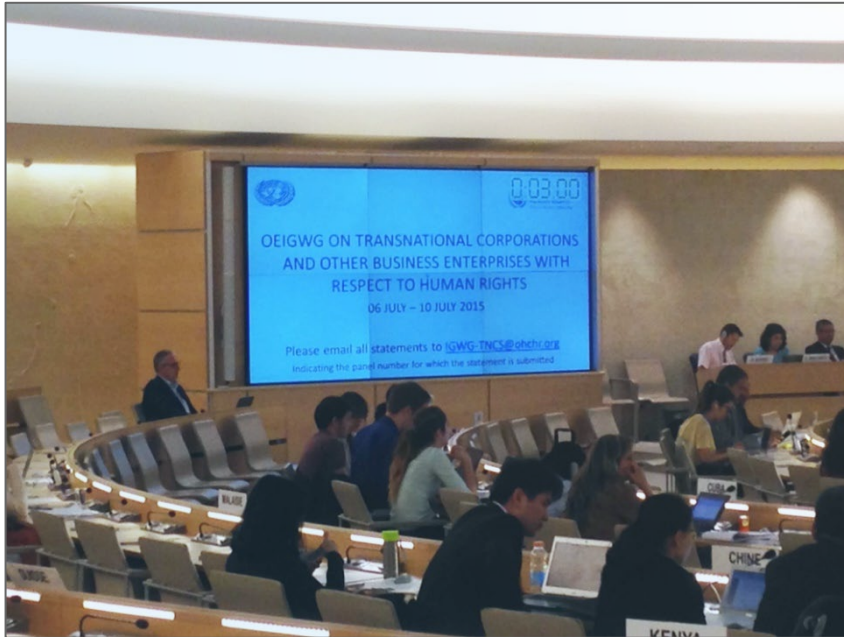
Above: First session of the OEIGWG (July 6-10, 2015)