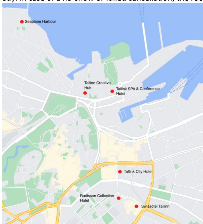
Map with recommended hotels and meetings venues

Cancellation policy: Reservations can be cancelled without charge until 48 hours before the arrival day. In case of a no-show or failed cancellation, the room rate for the first night will be charged.