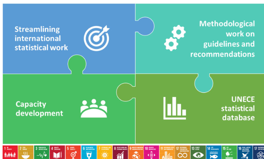
Interconnected work streams of the Statistical Division of UNECE