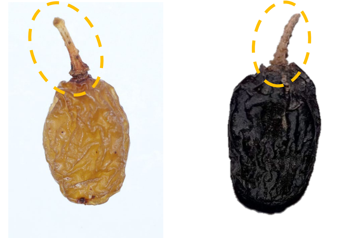
BERRIES WITH CAPSTEM ATTACHED