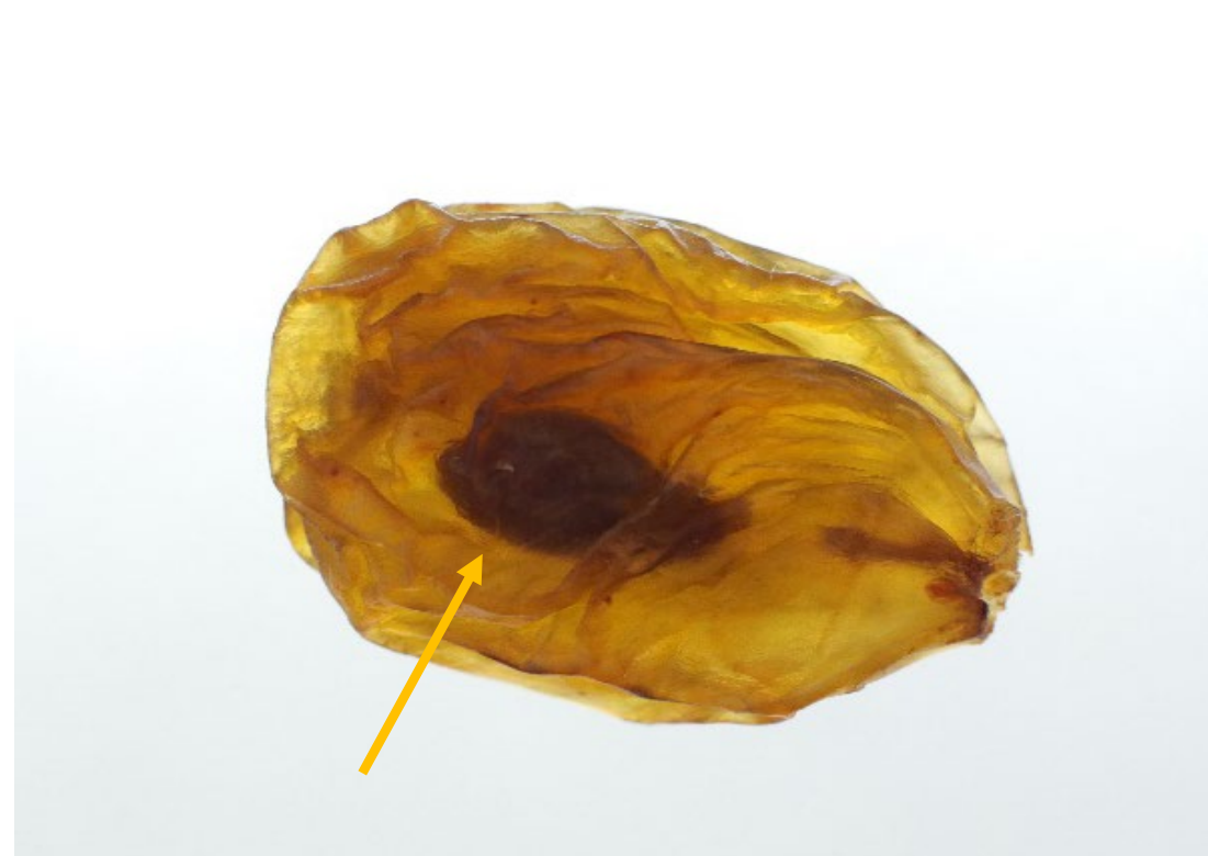
BERRIES HAVING SEEDS IN SEEDLESS TYPES