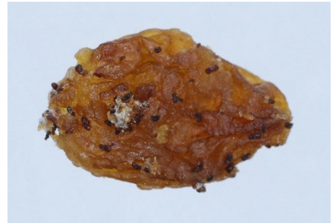
DAMAGED BY PESTS