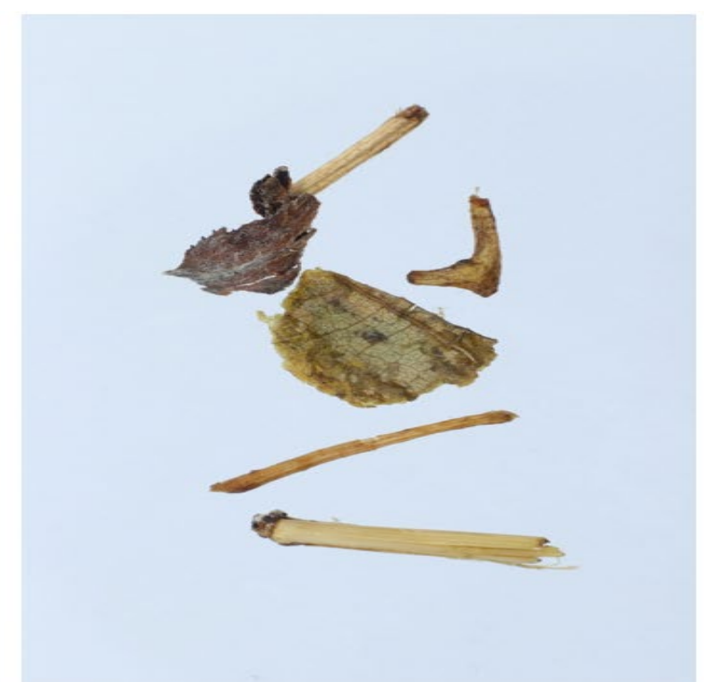
PIECES OF STEM/MINERAL IMPURITIES/EXTRANEIOUS VEGETABLE MATERIALS