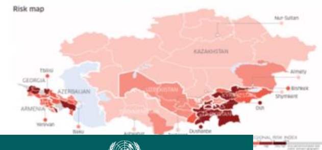
Caucasus and Central Asia: Subnational INFORM risk 2021