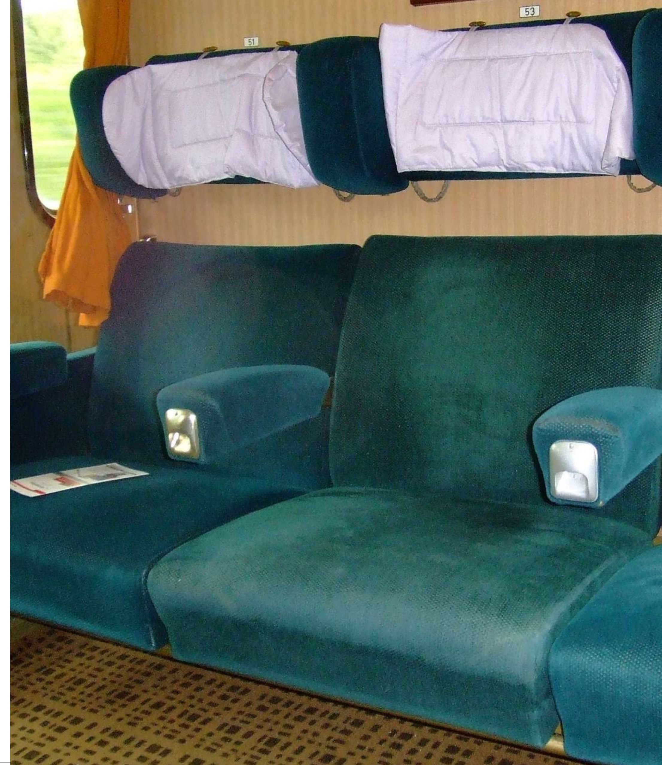
Empty old 1st class IC seats