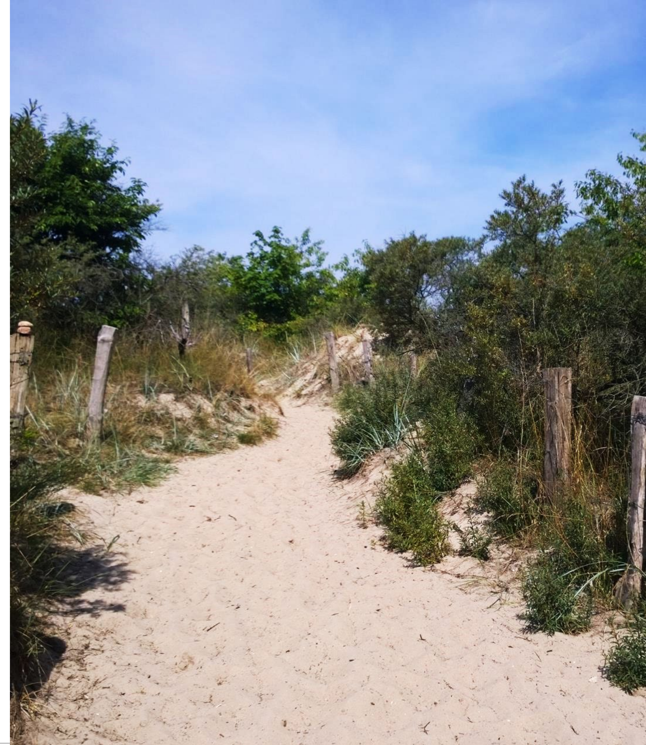
Way to the beach, Travemünde Priwall