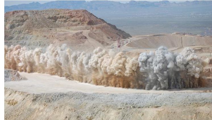
Mining and Explosives | Mines Canada

Existing regulations related to ammonium nitrate used in explosive mixtures are highly controlled at the federal level by Natural Resources Canada