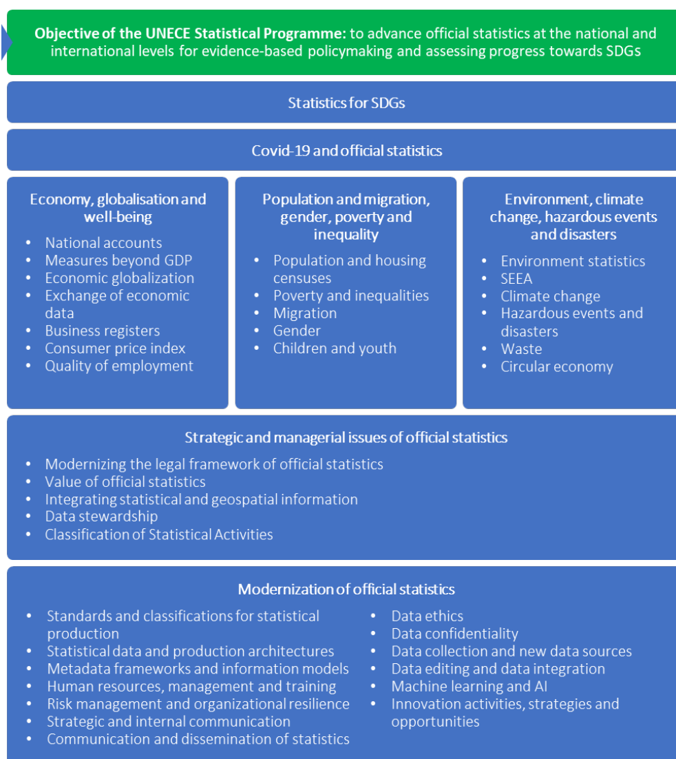
Figure 3. Methodological work by the UNECE Statistical Division