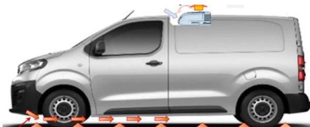
Case No. 2: Standard production vans with integrated insulation and unit partially recessed in the roof, with a roof air deflector: