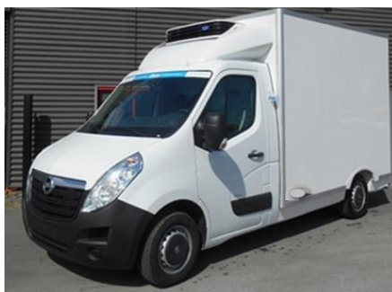
Case No. 4 : Standard production vans with integrated insulation and the unit installed under the chassis or in the engine compartment: