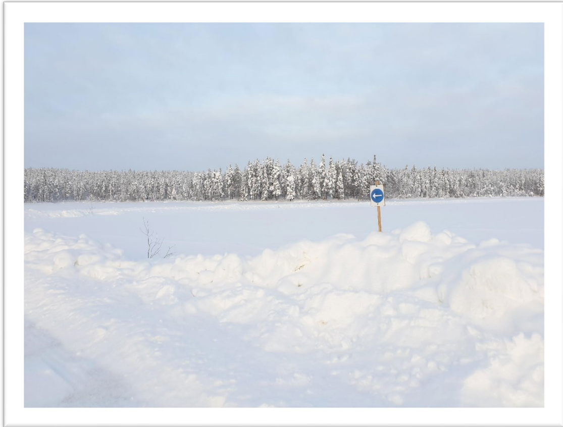
Fourth of February 2021, 12:30