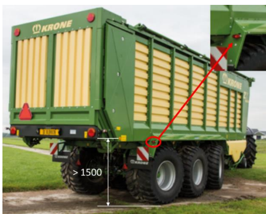
Figure 1 Position of additional reflectors: the lowest position of side reflectors is often above 1500 mm.